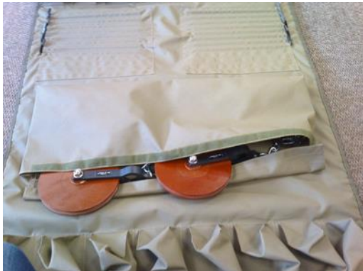
Storage canvas bag